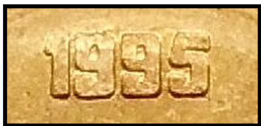
Type A Date épaisse.